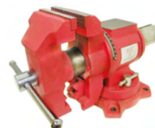
HIT® The tools professionals use 14-V50SH