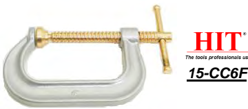
Forged Alloy Steel Frame 400 Series