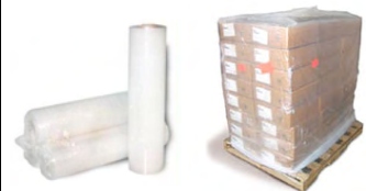
Pallet Shrink Wrap-Pallet Bags