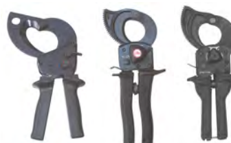
22-RCC20 22-RCC600 22-RCC750