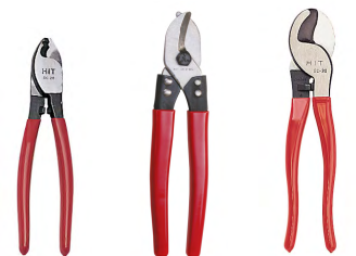
22-CC20 22-CC25 22-CC30