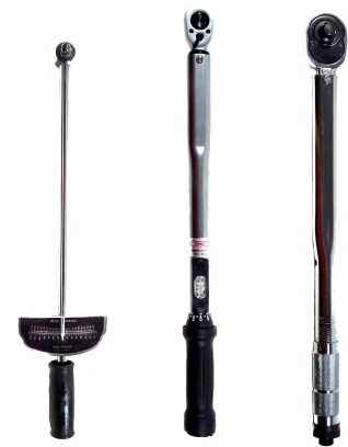
11-TW3812 11-TW12W 11-TW12