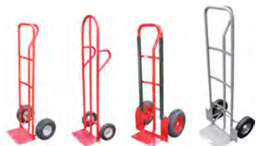
08-HT10 08-HT8 08-HT13 08-HT10H