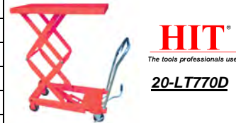
HIT® The tools professionals use