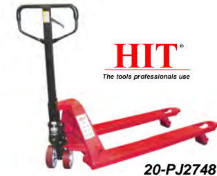
HIT® The tools professionals use